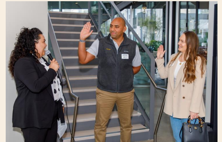
Spring Mix 2024